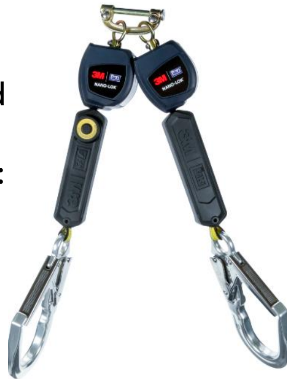
NEW MODEL Ref : 3101298 List price : 392 €