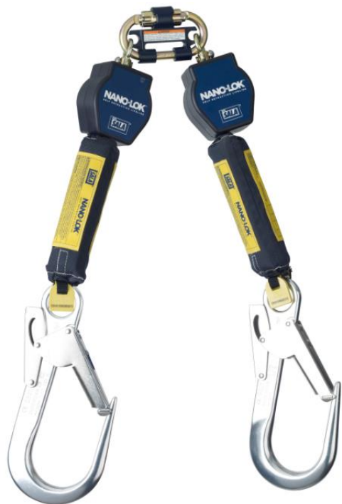
OLD MODEL Ref : 3101298 List price : 392 €